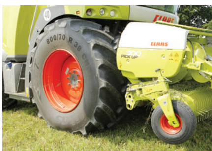
Mitas 800/70R38 SFT CHO mounted on a Claas harvester allows extremely low inflation pressure and maximum load capacity at the same time.

When it comes to load capacity of agricultural traction tires, this has increased from an average 1,000 kg in 1957 to almost 9,000 kg in 2017. The highest load capacity in the Mitas portfolio is offered by the