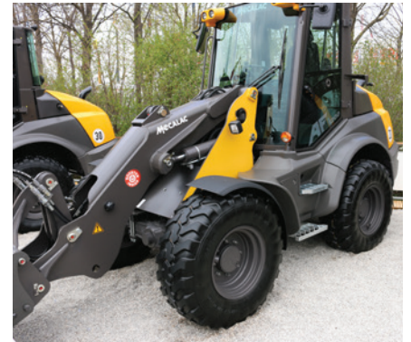
Mitas EM-01 405/70R20 tires mounted on a Mecalac AF1200 loader with an overall diameter of 1,076 mm and load capacity of up to 6,200 kg when stationary and inflated to 3.8 bars.

handling & construction tires. Mitas EM radial tires are used as original equipment by famous construction equipment manufacturers like