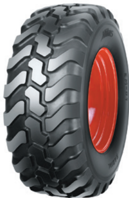
Non-directional EM-01 tread pattern for all-round application.

The EM-02 is a directional tread pattern based on agricultural tires, with outstanding traction on softer ground. Its high durability makes it especially suitable for loaders, telescopic handlers, and other lighter construction equipment. The properties of the EM-02 position it between agricultural and