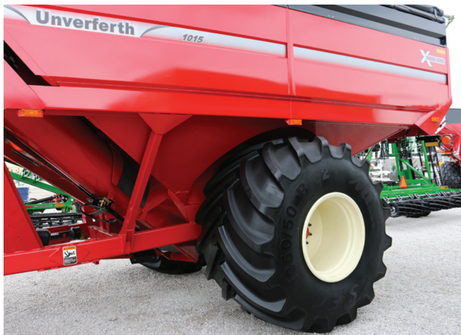
Mitas 1250/50R32 SFT tire mounted on a grain cart Unverferth 1015 Xtreme. With its width 1,220 mm and the overall diameter 2,020 mm, this is the largest tire in Mitas’ portfolio.

1250/50R32 CHO SFT 194 A8 (191 B). This tire’s nominal load capacity is 10,900 kg (at a speed of 50 km/h and inflated to 3.2 bars), but in the cyclic regime and at a speed up to 10 km/h this rises to 21,240 kg (again at 3.2 bars). High load capacities are not only offered by all radial Mitas tires for combines and harvesters, but also by tires such as the Agriterra range for heavy agricultural trailers.