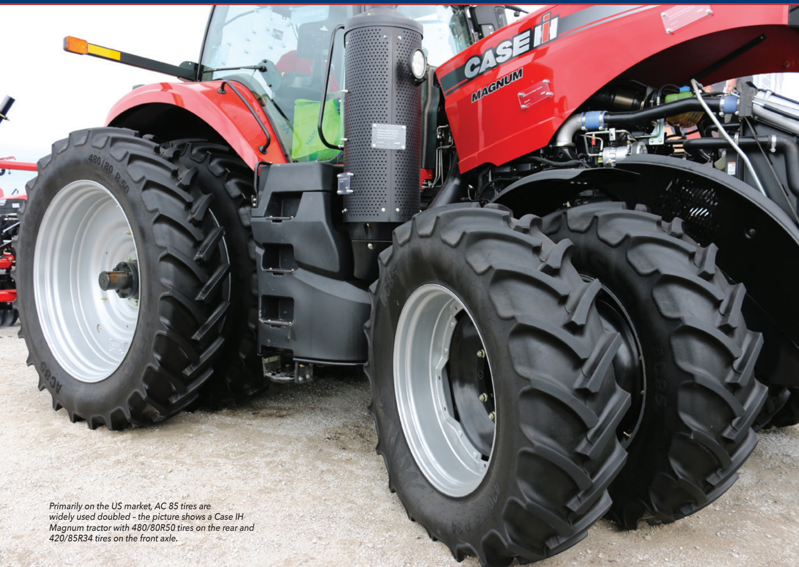
Primarily on the US market, AC 85 tires are widely used doubled - the picture shows a Case IH Magnum tractor with 480/80R50 tires on the rear and 420/85R34 tires on the front axle.