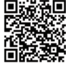
Learn more about AC 85 tires here.

North American market. While tires are sold using the 460/85R46 label on the European market, in America they are labeled 480/80R46.